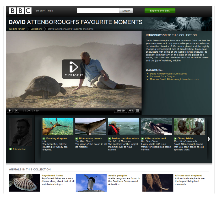
Fig. 4 A collection of David Attenborough's favourite moments from the last 30 years