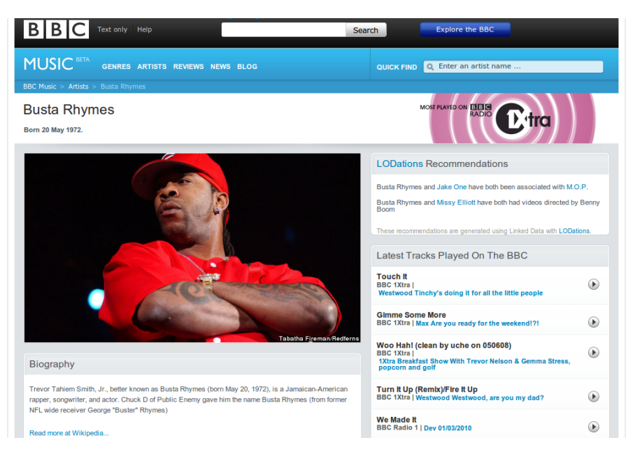
Fig. 3 Artist page for Busta Rhymes, along with recommendations generated from Linked Data