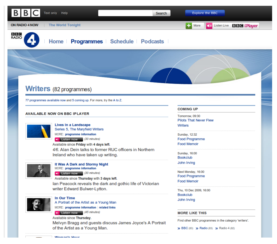
Fig. 2 An aggregation of BBC Radio 4 programmes associated with the subject 'writer'

on a Timeline . On the same version timeline, we can anchor Segments — classifications of particular temporal sections of a version. Most links to other ontologies are done at the segment level, as we might want to describe e.g. the recipe being described or the track being played. For example, it is at the segment level that we link to the BBC Music web site described in section 3. We can also classify segments using the same mechanism as described above, to associate a segment with a particular place, subject, person or organisation.